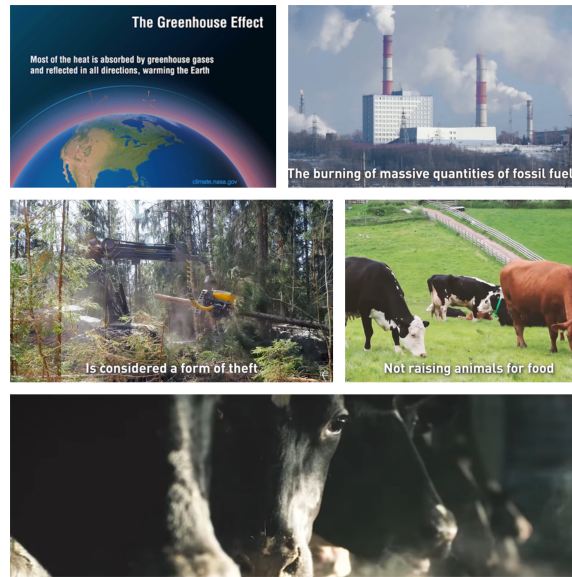
Figure 5 Scientific and Modern Imagery in “Say No to More.”

religions align their religion with the natural sciences” (2016, 194). He argues that appeals to the authority of science can be both in form and content , explaining how “[a]ppeals in form are found in the deployment of scientific-looking diagrams and scientific-sounding terminology, while appeals in content consist of claims that one’s religion is ‘scientific’ or ‘a science’” (2016, 199). In the discourse under analysis, both types of appeals occur frequently and in a variety of ways.