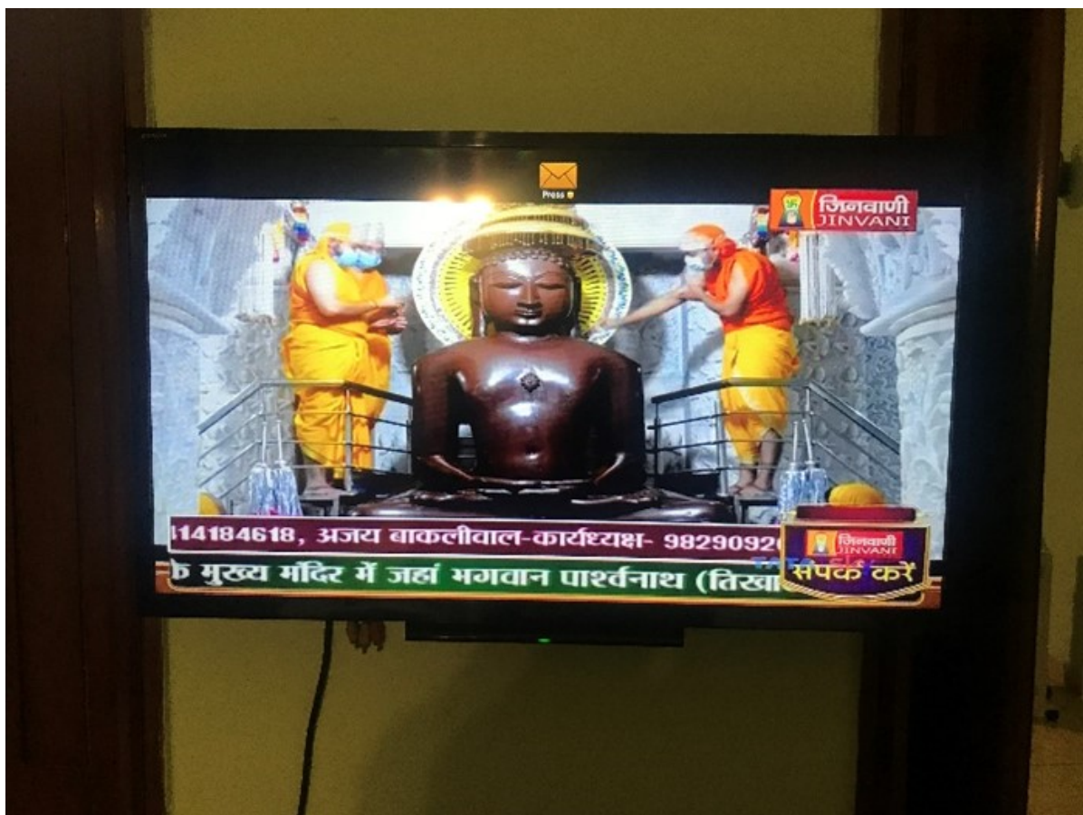
Figure 4 “Jinvani Channel.” Livestreaming of pūjā. Photo taken by my respondent in his living room on 4 January 2021.