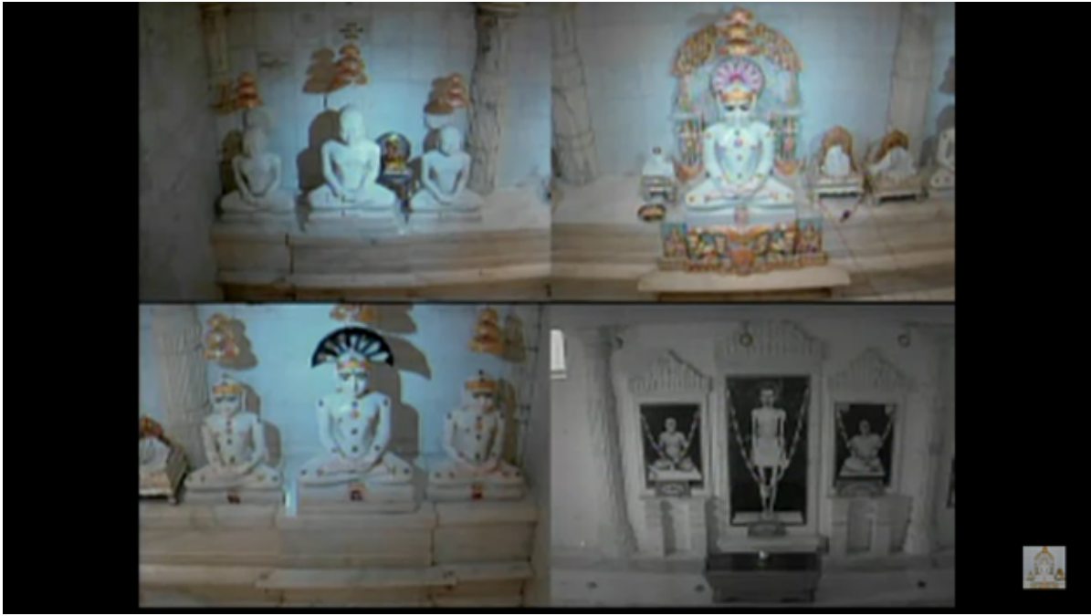
Figure 1 “Garbhara Darśan,” simultaneously showing Śvetāmbara (top left and bottom right), Digambara (top right), and Śrīmad Rājacandra (bottom left) images. Livestreamed by the JCNC on 30 March 2021.

rate channels. 20 One channel alternates images every six seconds, rotating not only between Śvetāmbara, Digambara, and Śrīmad Rājacandra images, but also bringing all the different images together on one screen at the end of a rotation round (Fig. 1). 21 Inadvertently, Jain devotees using this digital resource for darśan perform auspicious viewing for all sectarian images, regardless of their own sectarian affiliation.