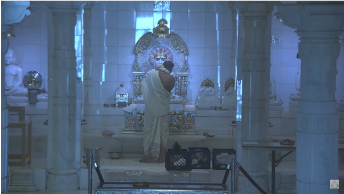
Figure 2 “Pūjārī performing Pūjā.” Livestreamed by the JCNC on 10 May 2021.