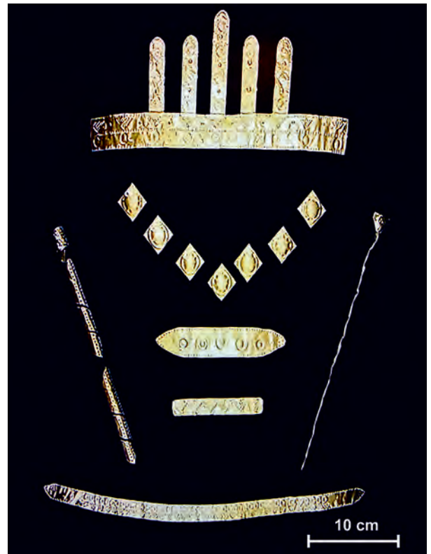
Figure 1. The gold finds from Bernstorf (copies) as they are displayed in the Bronzezeit Bayern Museum in Kranzberg.

The composition of the gold finds was first determined by XRF without clear description of the measurement parameters, but it was noted that the silver concentration was "less than 0.2 %" and both copper and tin concentrations were "less than 0.5 %" (Gebhard, 1999). It was further noted that gold of such high purity is virtually non-existent in nature so that it must be assumed that the gold was desilvered by the cementation process and that this was already practiced in the central